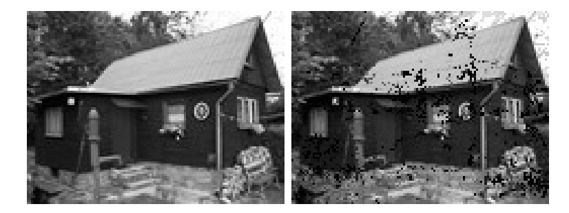
Fig. 2. Noise reduction based on the model (Q^*, \circ) (left) and on the model (\Delta(Q^*), \circ) (right).